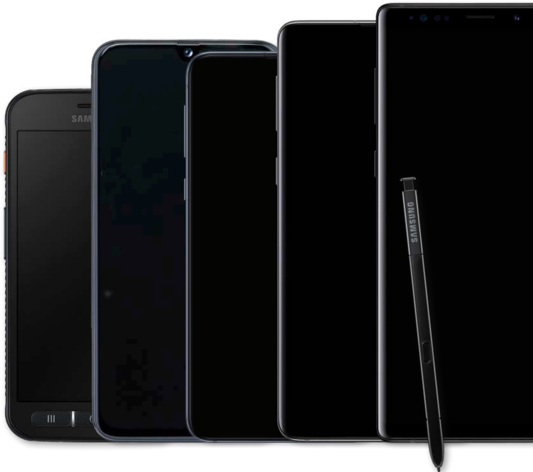
Galaxy XCover 4s The rugged business phone

Keep your business running with extra support for your devices. Galaxy Enterprise Edition gives you 3 years of enhanced service support, ensuring your mobile technology continues to perform. Our dedicated UK-based Business Services Centre can provide technical support and advice when required. And should any of your devices need replacing, we offer a next business-day replacement service. 1